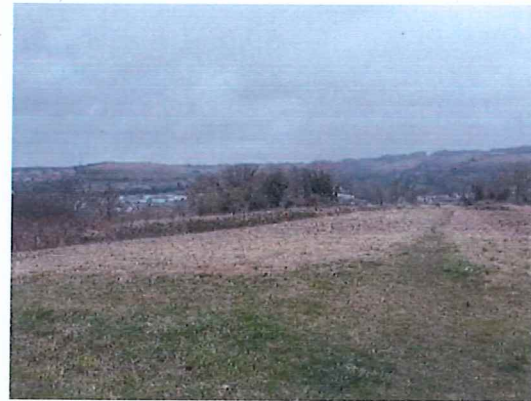
Volunteers clearing scrub in the High Meadow East Field and the results after raking, Feb 2024

We are working to get a dog poo bin installed near the entrance at Edgar Rd/Prospect Place allotments, as the poo situation has worsened recently. There is agreement that there is a need for one and we are currently working on the logistics of it being emptied, with the roads being so tight in the area.