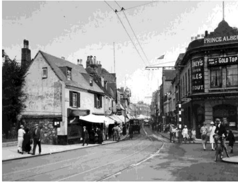
BIGGIN STREET 1920