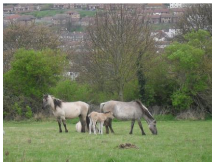
(Konik ponies at High Meadow)