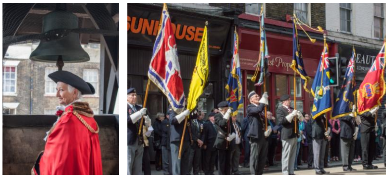
(Ringing the Zeebrugge Bell, 2014)

The Town Council is proud to host the town's annual Remembrance service at the People of Dover War Memorial each year.