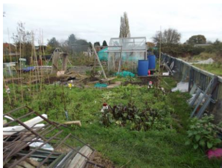
(Allotments in Dover)

We have a maintenance schedule to keep the sites safe for allotment holders. 2014/15 saw major repairs to the track at Prospect Place, a new key system following tenants' suggestions at our Open Allotments meeting in Autumn 2013 and the installation of palisade fencing and blackthorn planting to secure Maxton and Prospect further.