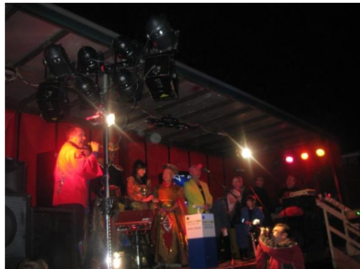
(Christmas Celebrations 2014)

The Mayor and panto characters from the Marlowe Theatre switched the lights on to great applause!